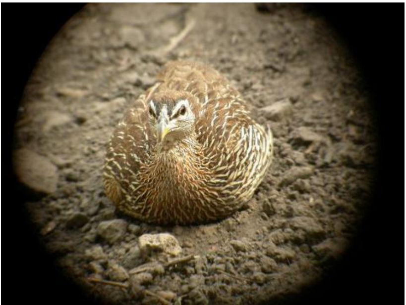
alkporo English: partridge Hausa: fakara