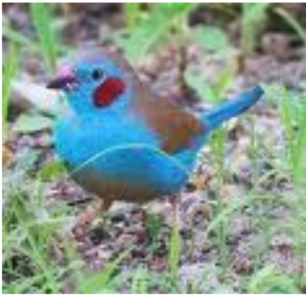
bãciciri English: red-cheeked Cordonbleu