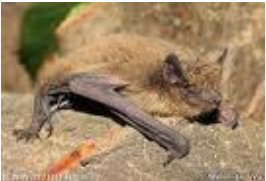
bilobilo English: pipistrelle