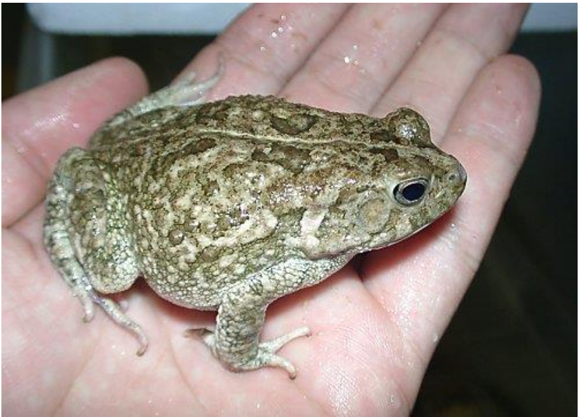
bakasu English: toad Hausa: kwa'do