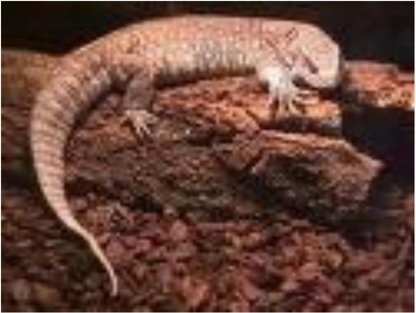
běe English: savannah monitor Hausa: guza