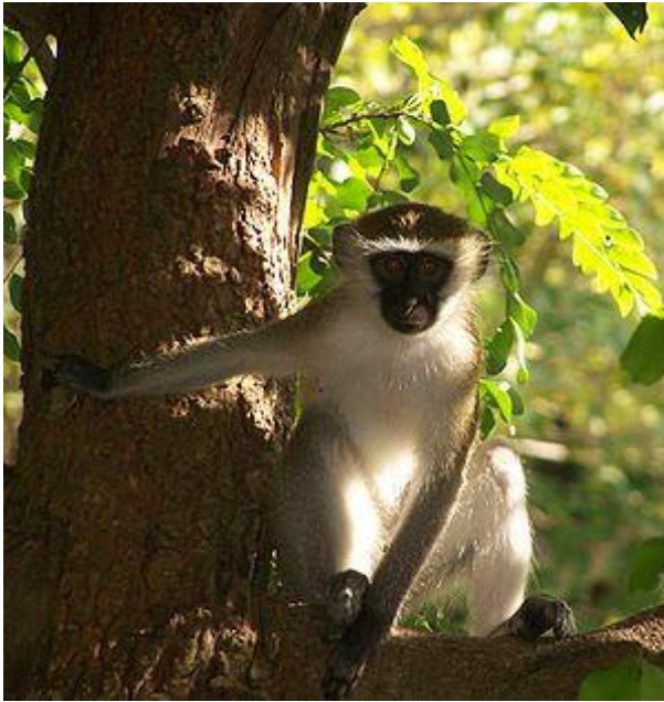
wesikona English: vervet monkey Hausa: bakinbiri