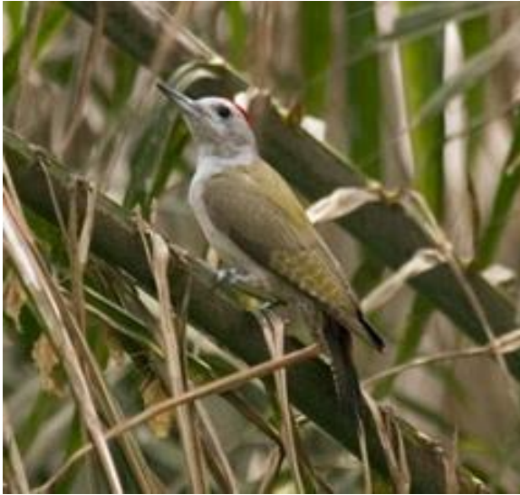
bãlizõzõnna English: woodpecker Hausa: makeri