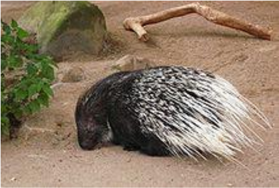
ẽmbusu English: porcupine Hausa: makaya