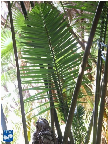
zaatēna English: raffia palm Hausa: tukurwa