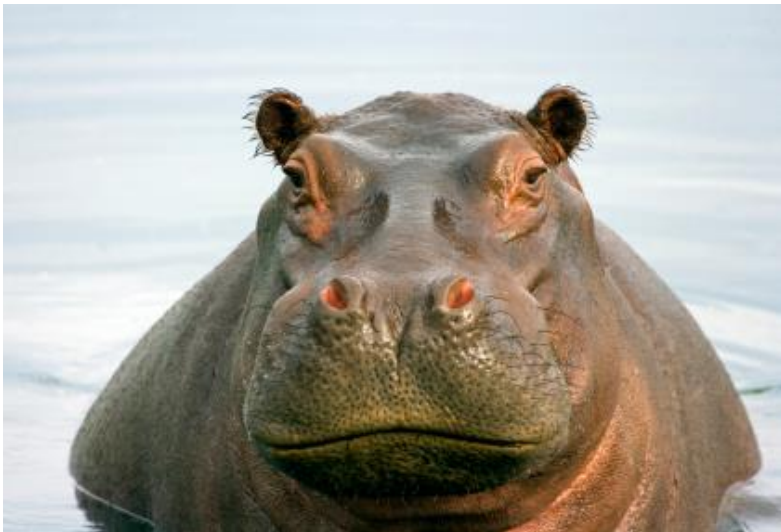
ɓɔɛ English: hippopotamus Hausa: dorina