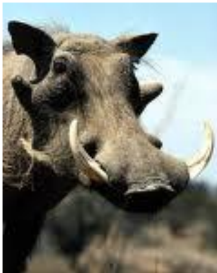
sakpa English: warthog Hausa: gyado