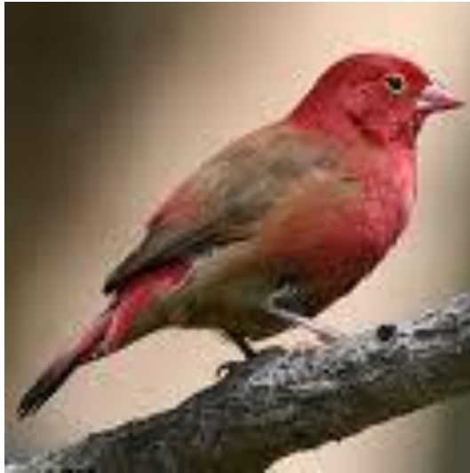
bãitina tẽa English: red-billed firefinch