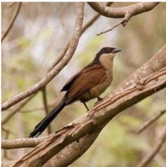
kadatuntuna English: coucal Hausa: sakatutu