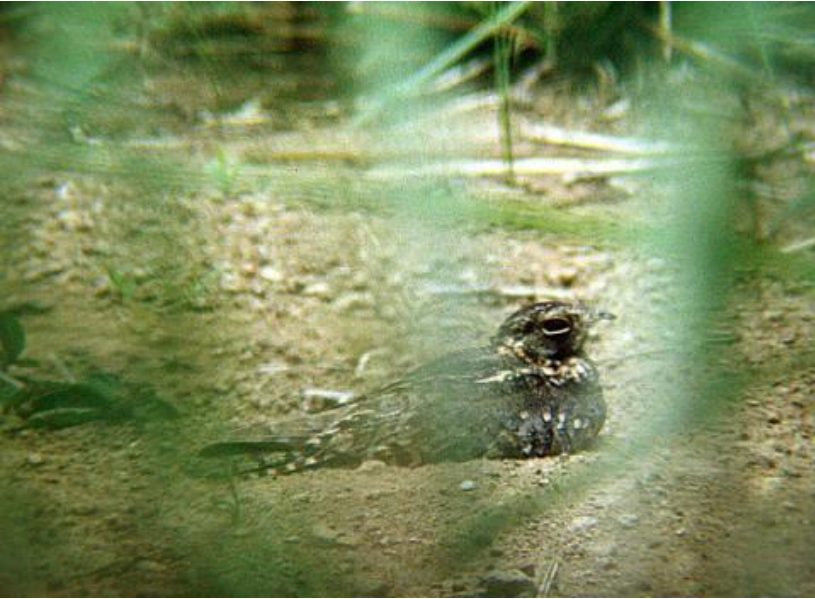
itonzõkõ English: nightjar Hausa: baddawawa