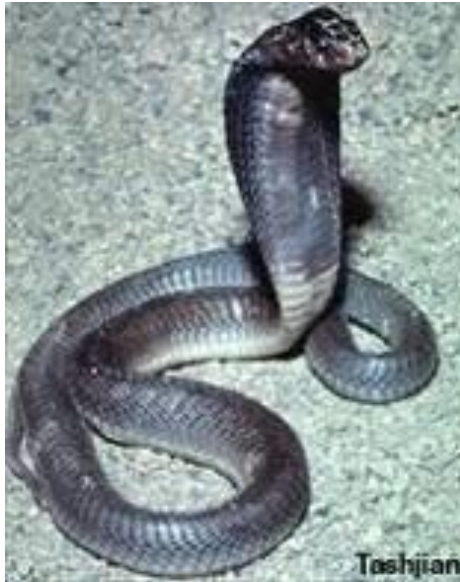
kĩa sia English: black cobra Hausa: gansheka