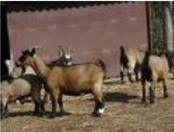
bè English: goat Hausa: akuya