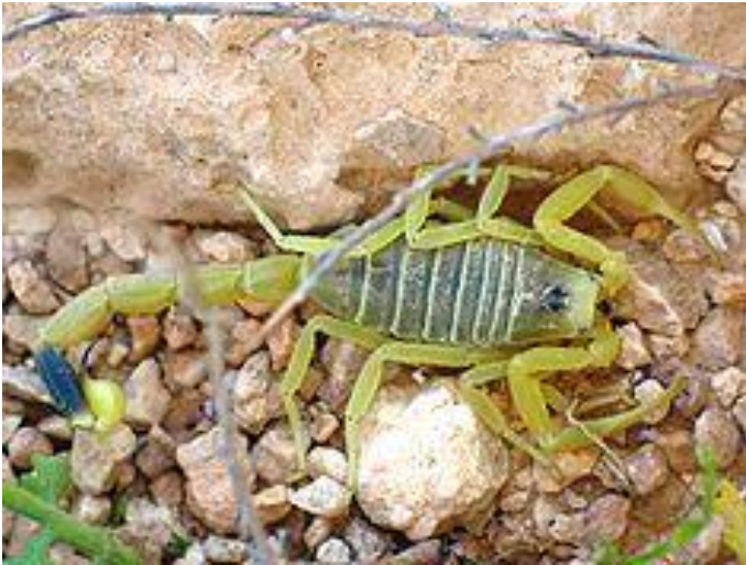
kəkəfī English: scorpion Hausa: kunama