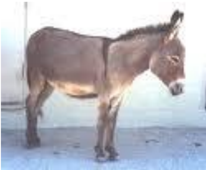
faaga English: donkey Hausa: jaki