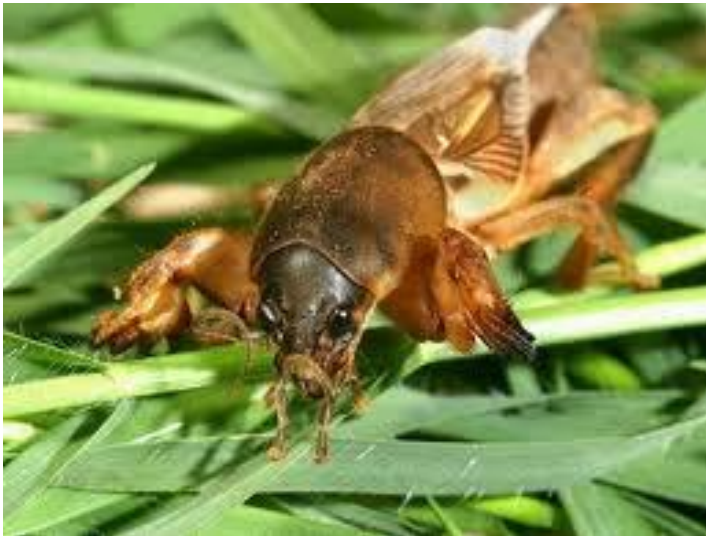
věntikina English: cricket Hausa: gyare