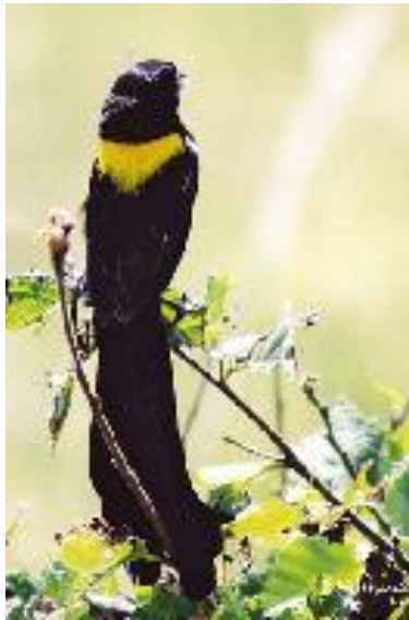
bã vīagbāade English: pin-tailed widow