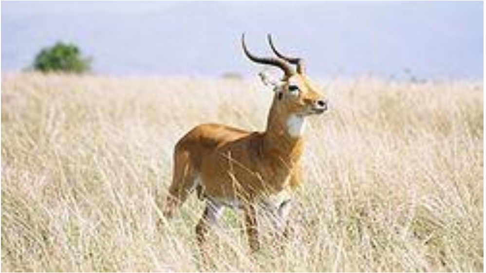
tue English: Kob antelope Hausa: maraya