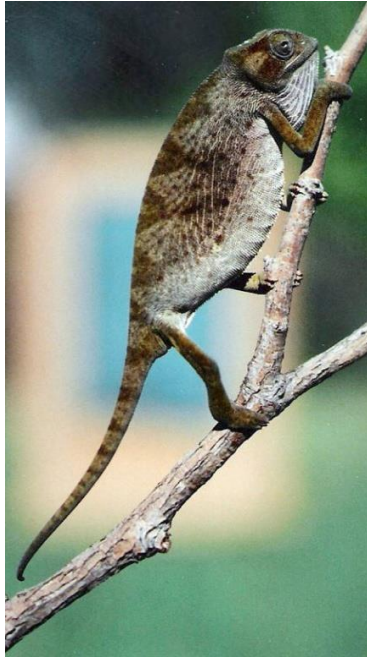
ikpāngu English: chameleon Hausa: hawainiya