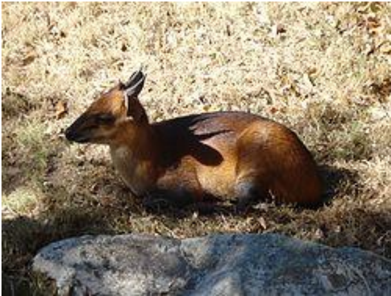
bantē English: red-flanked duiker Hausa: