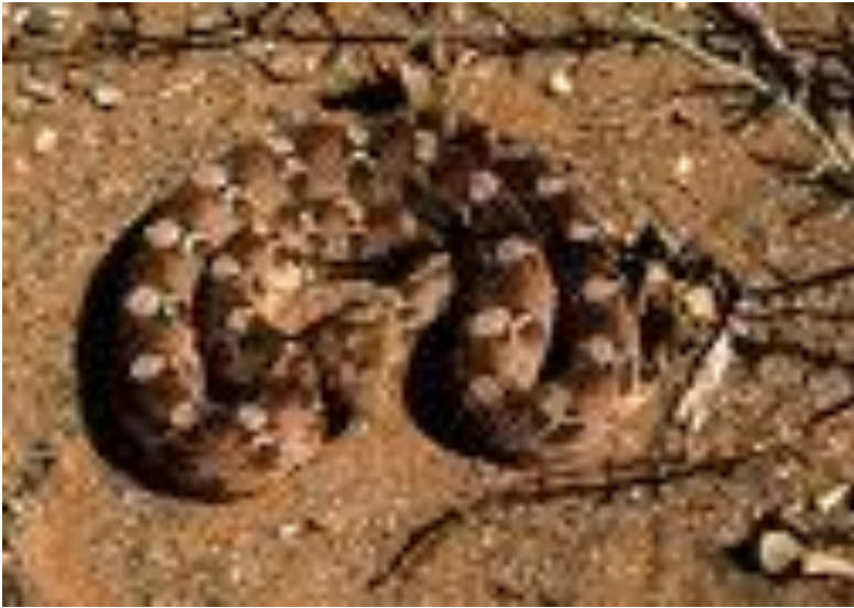
fidikona English: carpet viper Hausa: takwasara