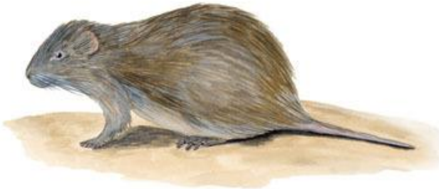
ẽnda English: cane rat Hausa: gyauji