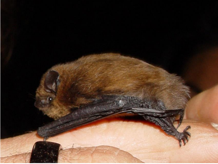
laabuisina English: pipistrelle Hausa : bilibilo