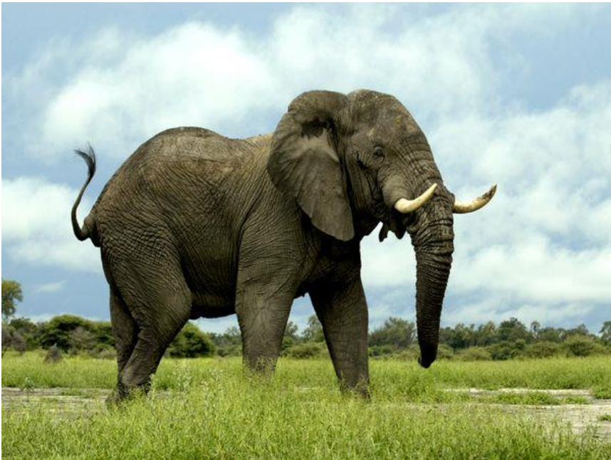
Animals, birds and trees in Illo Busa.