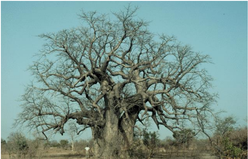
fɔ̃ li English: baobab Hausa: kuka